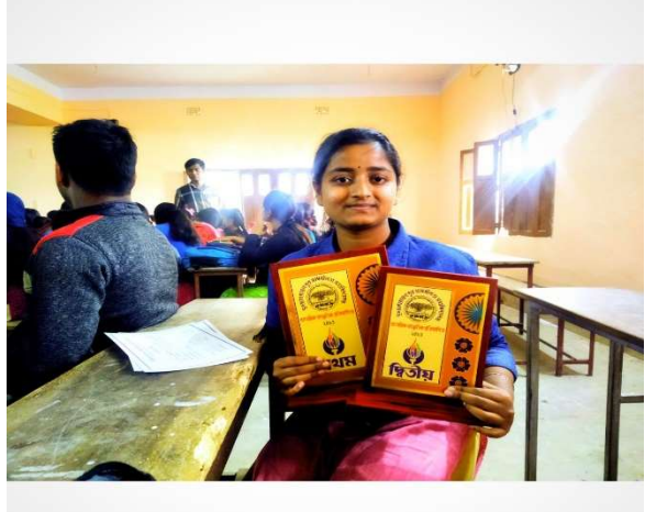
Students ranked both in Annual Competition at college and in Inter College Competition in Ramakrishna Mission Vidyamandira, Belur, 2022