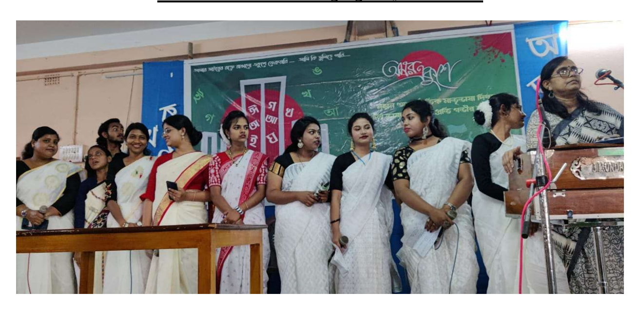
Teachers' Day Celebration