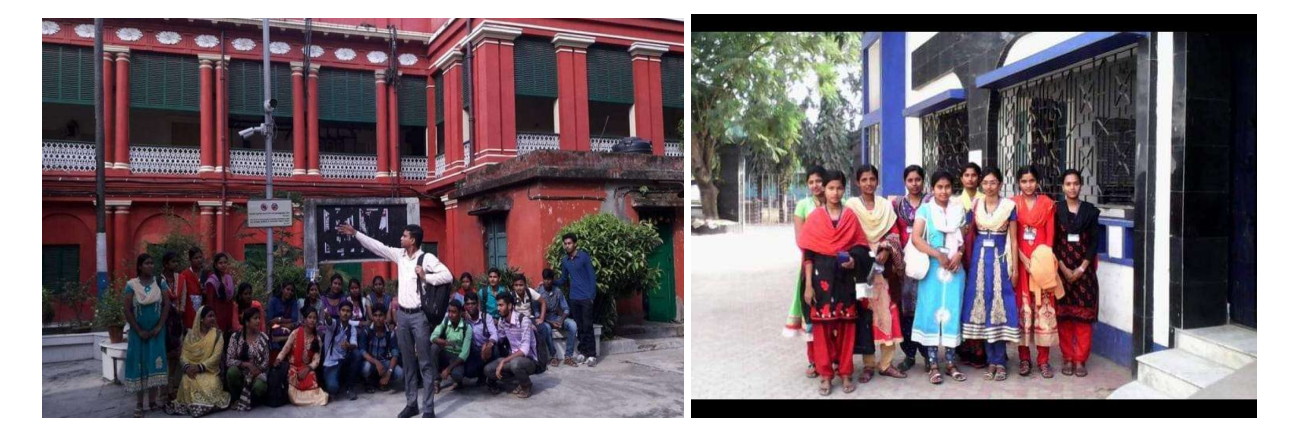
Field Trips at Jorasanko Thakur Bari, Kolkata and Viswa Bharati, Shantiniketan, Bolpur

Excursion : Educational tours are extremely helpful to dive into the experiential learning methodology. The students not only feel the exact essence of field, they also learn the techniques of survey, the connection with community, the bond between history and literature and many more.