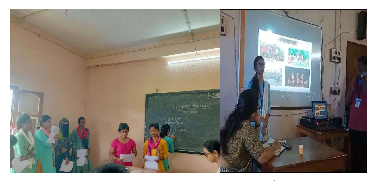
Group Discussion and Students' Presentations using ICT (Students of 6<sup>th</sup> semester Honours)

<u>Students' presentations using ICT and Group Discussion:</u> We encourage Group discussions among students to build up communication skill and listening skill. Our students are trained in delivering presentations using ICT which make them enabled to boost confidence in themselves and nurture critical thinking.