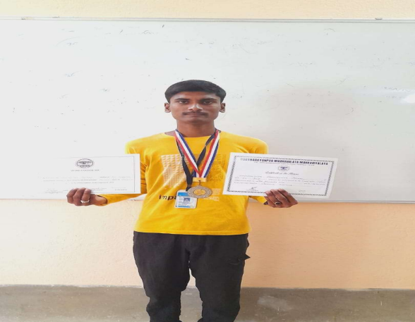
Students of the Department of Bengali bagged several prizes in Youth Parliament Competition, 2022